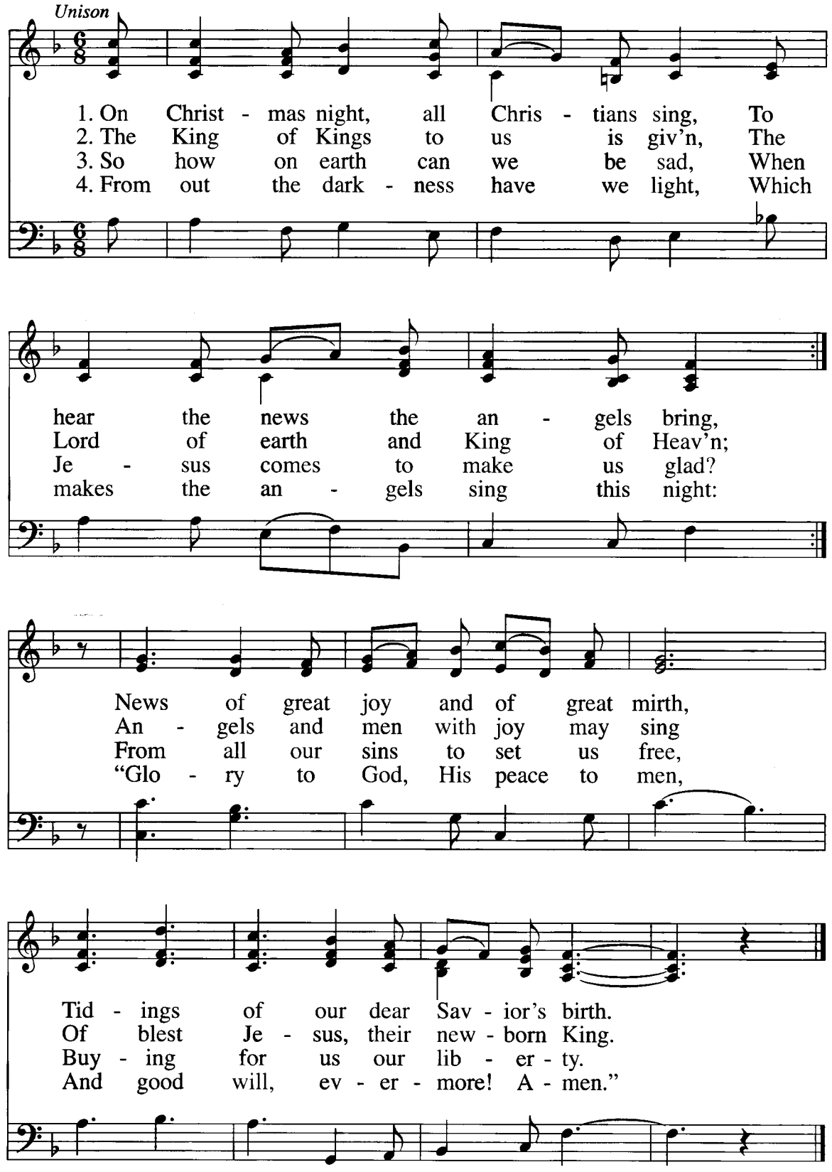
"He," "Him," or "His" may be replaced by "God('s)" or "You(r)."